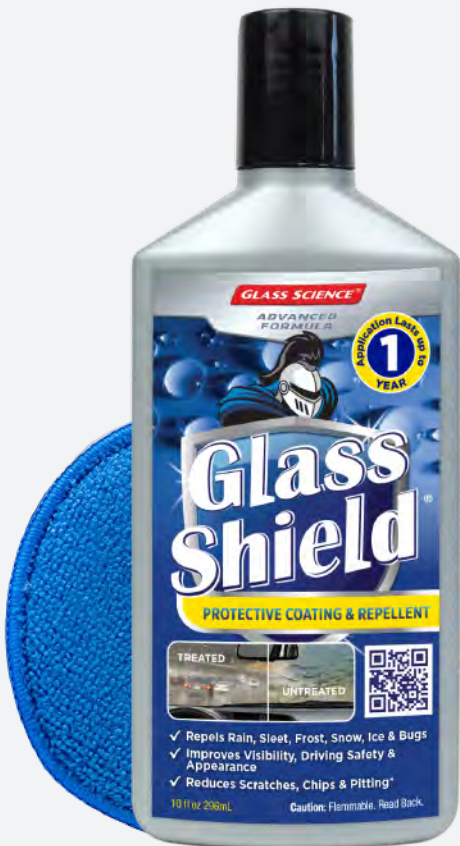
Available in 10 fl oz

Glass Shield makes rain, sleet & snow “bead” into small droplets, which are removed by aerodynamic wind flow for improved visibility, safety & driving comfort. It also reduces the adhesion & buildup of frost, snow, ice, salt, mud, bugs & grime for easy removal. *Glass Shield increases scratch & chip resistance up to 92.9% to reduce the need for windshield replacement. Nano-tech coated glass is 23% more resistant to wear.